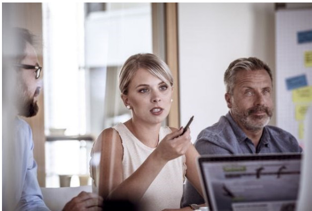
Agile working practices require new communication tools

In today's increasingly digitized world, agile working practices including mobile and remote working have become the new normal. According to Gallup, 43% of employees in the US worked remotely in some capacity, spending at least some of their time working in a location different from that of their coworkers 1 – whether in a different branch office or even a different country altogether. Working away from an office has been commonplace in sectors like construction or in sales roles, but now mobile technology has provided businesses with greater scope to offer flexible work – for example, as an incentive in a competitive labor market. Hence, the nature of the workforce has changed dramatically, with a tenth of companies' staff now working from home three or more days a week 2 .